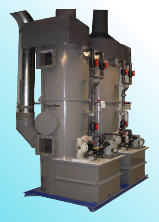
Dual Tower Fume Scrubber for Handling Airborne Radioactive Particulates

Mech-Chem brings 25 years of chemical process design experience and expertise to the design, fabrication, and installation of our ventilation and fume scrubber systems. Our company provides complete professional solutions that can control and treat our client's fume and exhaust problems.