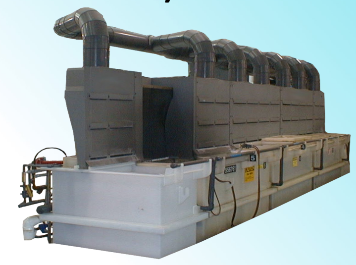
10,000 CFM Push/Pull Ventilation System for Hydrochloric Acid Stripping Operation